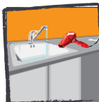
Picture 3 - This is dangerous because